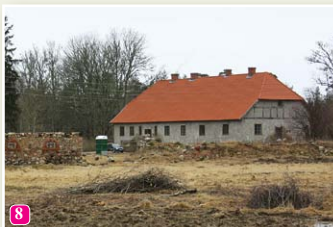
The former parsonage dwelling house