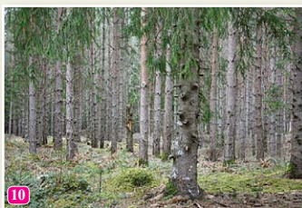
The Kaziņmežs forest