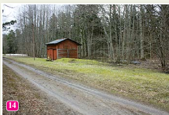
The old narrow-gauge railroad