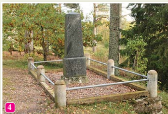
The Old Taizelis monument