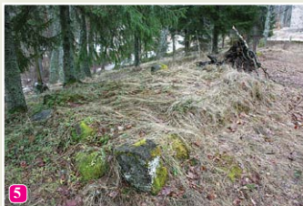
The werewolf's grave