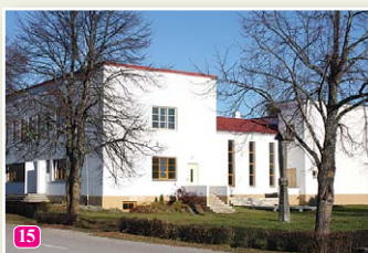
The Liv People's Centre