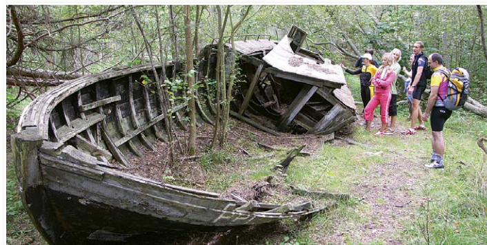
The Boat Cemetery