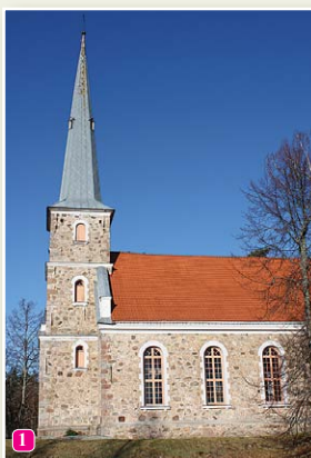
The Mazirbe Lutheran Church

22 The location of a former saloon on the side of the Mazirbe-Cirste road in Ūbeles.