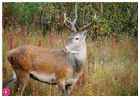
The red deer ( Cervus elaphus ) represents the largest population of deer in the SNP. During mating season, you can hear the bulls roaring and battling it out with their horns. That is something which every nature lover will remember for all time.