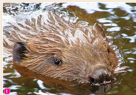
The beaver ( Castor fiber ) lives throughout the Slītere National Park and actively transforms its environment. The animal can be seen and heard from a distance of just a few metres.