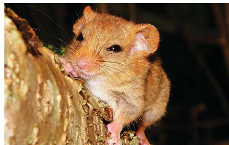
A common dormouse, Muscardinus avellanarius

The Slītere National Park features several other hikes, as well as bike, water and auto routes. Look for a list of routes on www.countryholidays.lv and for markings out in nature.