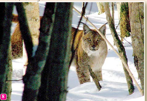
The lynx ( Lynx lynx ) is a very cautious animal – the only wild feline in Latvia. It is a myth that the lynx jumps on people from tree branches – it hunts on the ground.