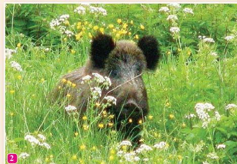
The wild boar ( Sus scrofa ) is one of the more common large mammals in the park. During the spring it feeds out in the open and can be easily spotted.