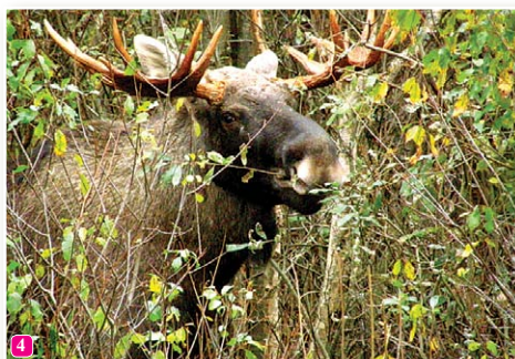
The Eurasian elk ( Alces alces ) is the largest stag in the world. The SNP with its swamps and forests, is tailor-made for this giant. The Eurasian elk can sometimes be seen at roadsides.