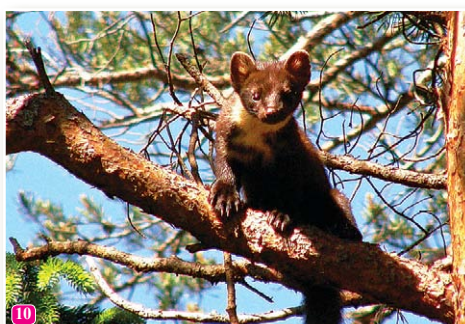
The European pine marten ( Martes martes ) mates during the summer and can be seen during the day. Female martens are lighter than males, and they are more likely to be spotted up at the top of trees.