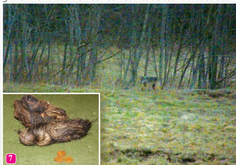
The wolf ( Canis lupus ) is very seldom seen, because it is a secretive animal – you'll find wolf excrement far more often in the Slītere National Park than the animal itself. Wolves love to hunt wild board.