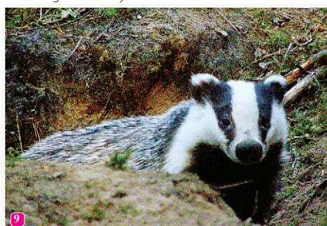
The Eurasian badger ( Meles meles ) is akin to the stoat and the ermine. Most of the year the badger comes out only at the night, but in early summer, when its young are waiting for their parents in the cave, they sometimes appear during the daytime, too.