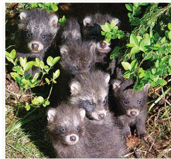
Raccoon pups, Nyctereutes procyonoides