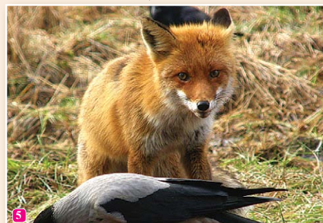
The fox ( Vulpes vulpes ) can be seen hunting mice in fields and meadows during the spring. The fox has outstanding smell, hearing and vision.