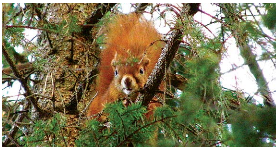
A squirrel, Sciurus vulgaris

Animal-watching at the Slītere National Park is only possible in the presence of a guide, and only for small groups of one to five people (the park asks that children under the age of 15 not be brought along). The process involves sitting around in special towers for several hours, which is why such tours are offered only when the temperature is above 0°C. You must bring water-resistant and comfortable shoes, warm and "quiet" apparel (it doesn't crinkle or make other noise, and it is not in a noisy colour). You will be walking around 2 km. Bring binoculars, a camera, snacks and non-alcoholic beverages. You must apply for an animal-watching tour at least two weeks in advance. Contact "Lauku Ceļotājs" on +371-6761-7600, or write to lauku@celotajs.lv .