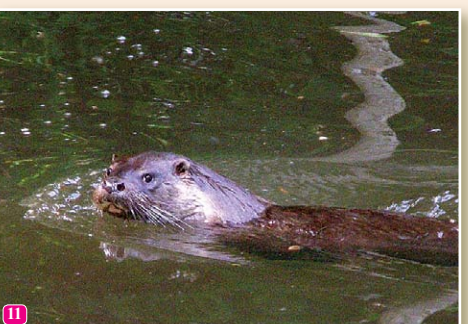
The otter ( Lutra lutra ) finds food in trout streams. During the summer it is a 24/7 animal.