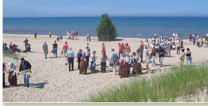
On the seashore at Mazirbe

he Slitere National Park features several other hikes, as well as bike, water and auto routes. Look for a list of routes on www.countryholidays.lv and for markings out in nature.