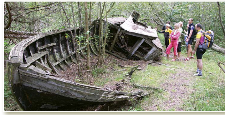
The Boat Cemetery