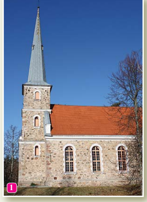
The Mazirbe Lutheran Church