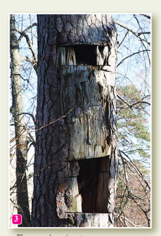
The secular pine tree