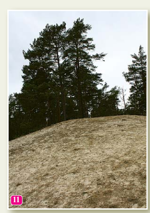
The White Dune