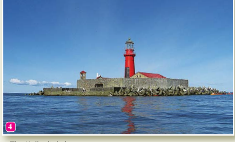
The Kolka lighthouse