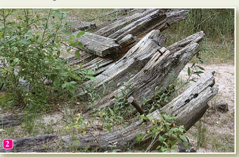
The wrecked ship