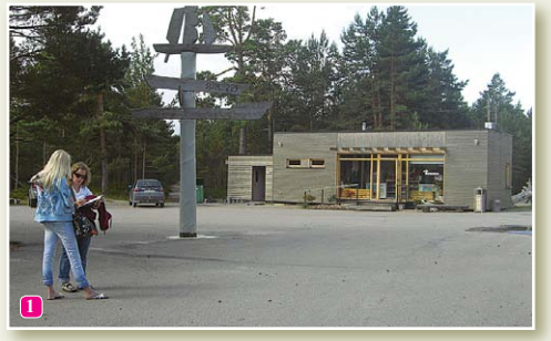
The Kolkasrags Visitor Centre