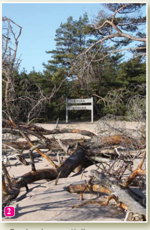
On the shore at Kolka