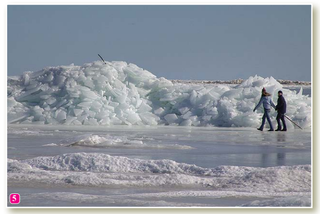
The winter by the Baltic Sea

The monument to "Those Taken by the Sea"