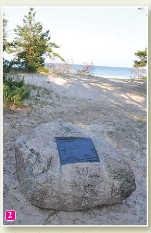
The rock marking the centre of Europe