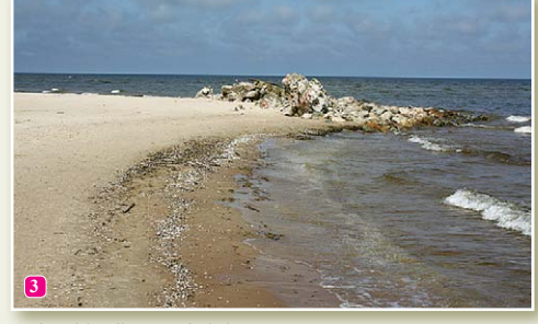
The old Kolkasrags lighthouse